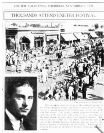
Newspaper article on the 1931 Exeter festival parade.

Join us on August 18 at 7 PM and learn about these historic spectacles that speak of Exeter's vibrant history.